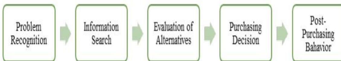
Figure 2.3 Five stage model of the buying decision process

The buying decision process is the order of purchase decisions of consumers. According to a large number of consumer surveys about the decision-making process, consumers are required to go through a five-step process: need recognition; information search; evaluation of alternatives; purchase decision; and post-purchase behavior, as is detailed below: